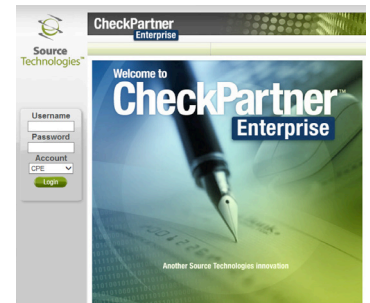
CheckPartner Enterprise Login