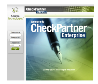
CheckPartner Enterprise Login